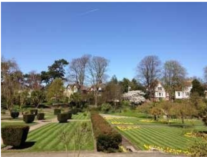
Spring colour in the gardens

Situated in the upper gardens, the rockery is a dry south facing area which was once planted with sub-tropical species of trees, plants and alpines. The traditional planting has been modernised, updated and redesigned with innovative Japanese style species which are more sustainable, having a low watering requirement. Inspired by the winter walk at RHS Harlow, the winter garden uses textures, brightly coloured stems and foliage, winter flowering and berry bearing species to enliven the upper gardens in the cold, dark months.