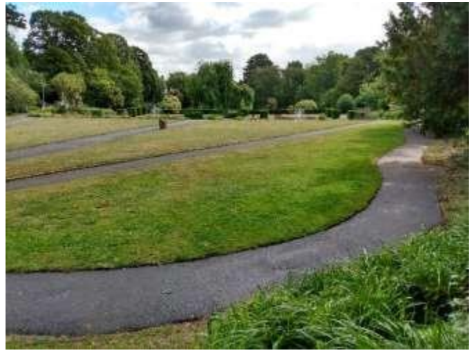
Upper garden proposed wildflower / bulb lawns