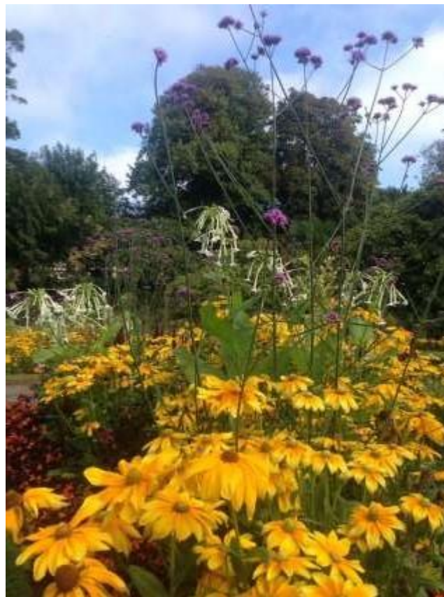
Pollinator attractive seasonal bedding scheme