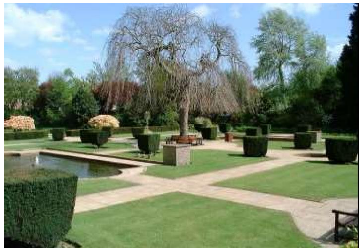
Ponds and yew box hedging