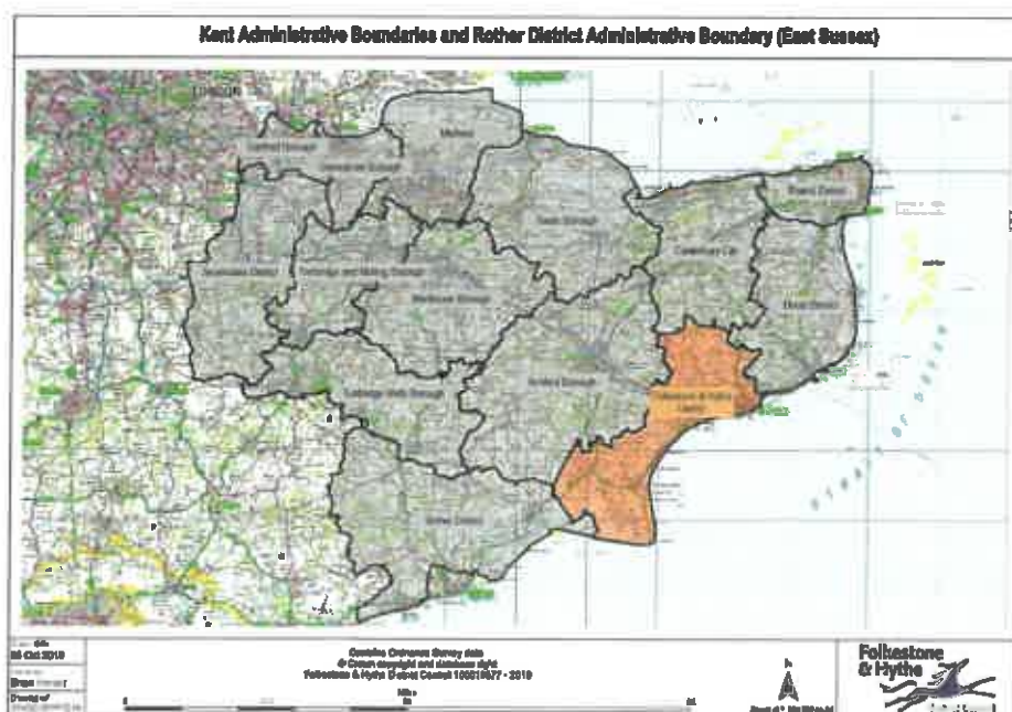
Figure 2.1. Geographical relationship between FHDC and Kent and East Sussex

2.3 The geographical relationship of FHDC in the context of Kent (upper tier authority) and neighbouring East Sussex is represented in Figure 2.1.