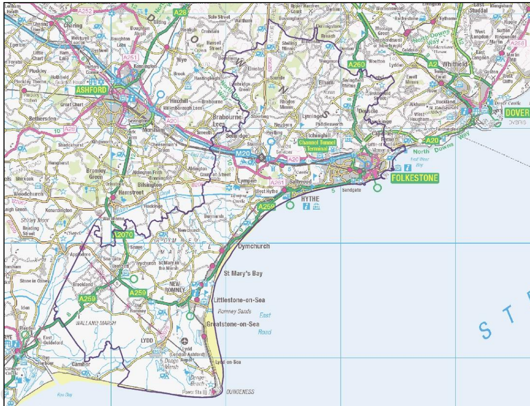
Figure 1: Folkestone & Hythe District Boundary

3.1 Folkestone & Hythe District Council's development plan comprises a series of documents which, as a whole, set out the long-term strategic plans for the district, as well as a variety of other non-strategic planning policies to manage development within its boundaries.