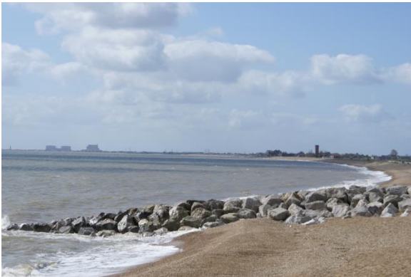
St Marys Bay towards New Romney and Dungeness beyond

2.1.2 A Neighbourhood Plan is a means for local communities to establish planning policies for their local area. The aim is for a Plan to set a vision for the future indicating what can be built and where. The St Mary in the Marsh Neighbourhood Plan has been prepared by St Mary in the Marsh Parish Council.