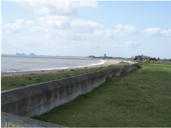
Dungeness Power Stations from the Rugby Portobello Trust land

4.3.3 There is planning permission to expand Lydd Airport which is expected to generate a number of jobs directly and also indirectly as it becomes a focus for other companies.