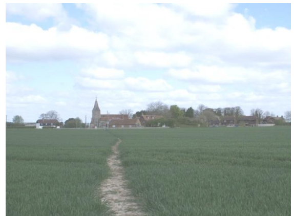
St Mary in the Marsh

4.2.2 This will help to meet housing needs and limit impacts on the Romney Marsh landscape.