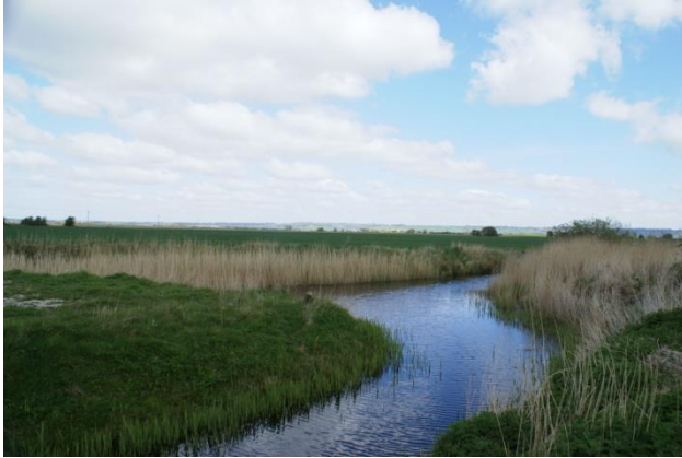
Romney Marsh Landscape

4.5.2 Particular concern has been raised regarding demand for wind and solar energy farms. The benefits of renewable energy are supported as is its application at a domestic level. However, large scale commercial proposals are not considered appropriate in the rural area because of their impact on the open landscape.