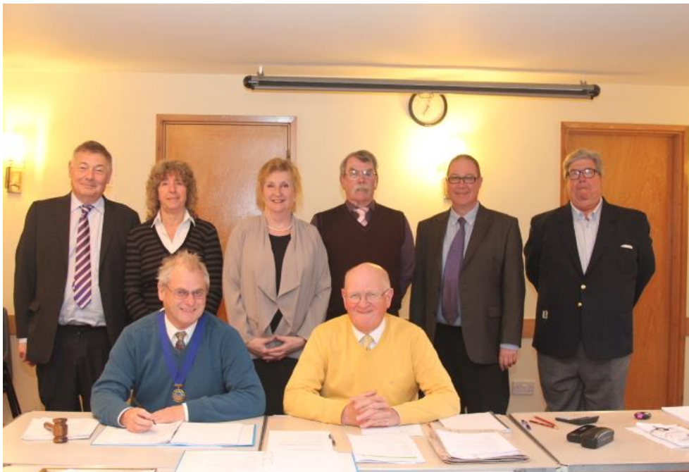
St. Mary in the Marsh Parish Council (2011-2015)

The St Mary in the Marsh Neighbourhood Plan is led by the St Mary in the Marsh Parish Council and aims to address local concerns and particularly to make provision for younger people by creating suitable housing, leisure and employment opportunities. It will improve the physical environment and encourage the development of new leisure and recreation facilities while supporting investment in farms and agriculture.