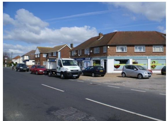
St Marys Bay Village Centre

4.4.1 The centre of the village is a focus of community facilities but is currently of mixed appeal. It is recognised that the appearance of the area has considerable scope for improvement and it is intended that a programme of environmental improvements be prepared. Whilst these improvements will largely be outside the scope of this plan the Parish Council will support them where possible. The Parish Council will develop a programme of proposals which will form Appendix 2 to this Neighbourhood Plan.