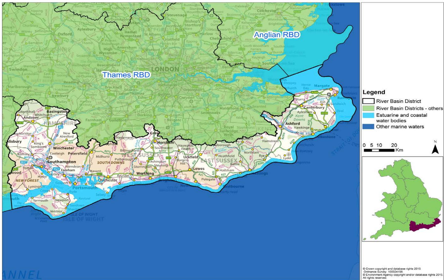
Figure 1: Map of the South East river basin district