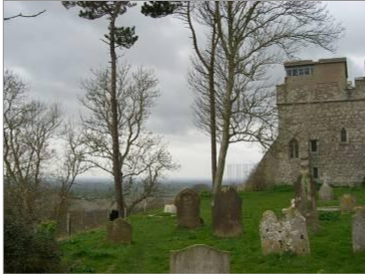
The WW 2 addition to Lympne Castle remains on account of its historic significance