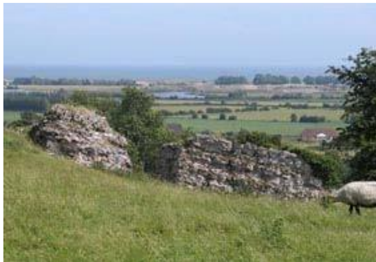
The last remaining fragments of Stutfall, the Roman fort once the centre of intense port activity