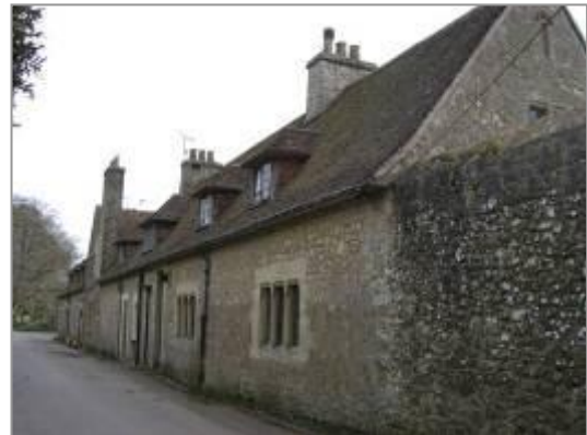
Left: Lympe Castle, restored in 1905 by Sir Robert Lorimer