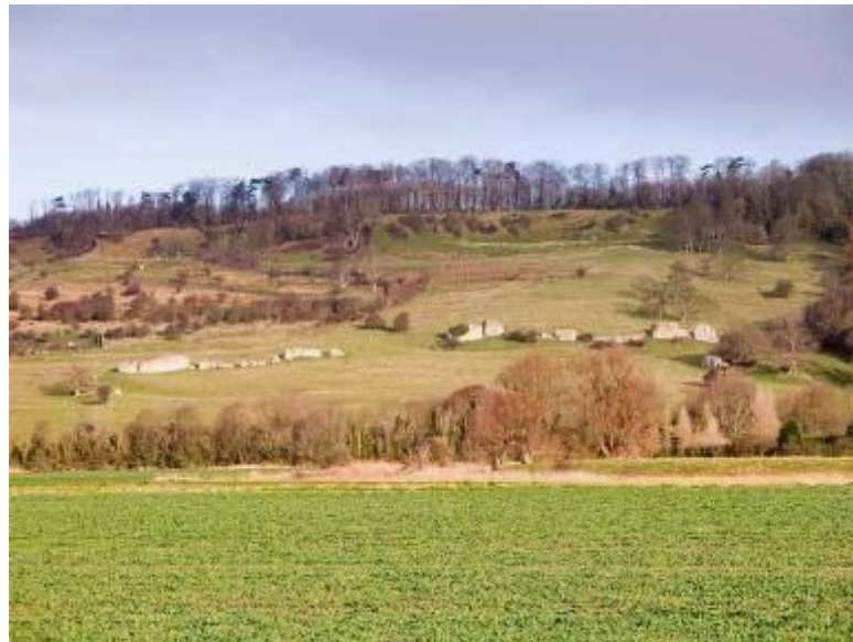
The limestone and clay escarpment with the ruins of the Roman fort at its base