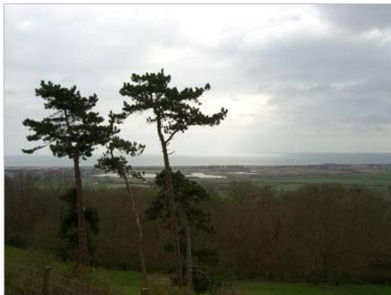
Romney Marsh from the escarpment with views of the Royal Military Canal on its winding course from Hythe to Appledore.

"Away below one's feet, almost at the bottom of the hill, the Marsh begins and spreads and spreads in a mighty crescent that sweeps about the sea, the Marsh dotted with the church towers of forgotten medieval towns, and breaking at last into the low blue hills by Winchelsea and Hastings; East hangs France between the sea and the sky; and round the north, bounding the wide perspectives of farms and houses and woods, the Downs, with their hangers and chalk-pits, sustain the passing shadows of the sailing clouds."