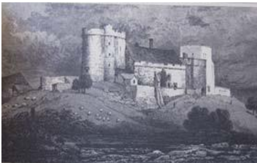
C18 th engraving of Lympne Castle