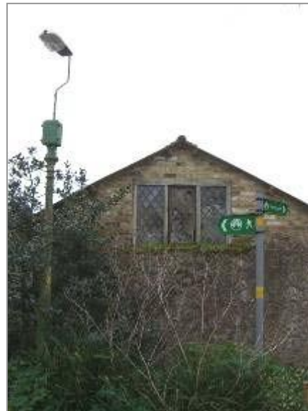
Left: The village sign, in need of decorative maintenance; Right: Utilitarian signage offers the potential for enhancement through design.