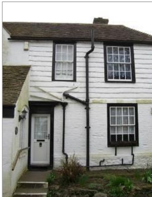
Left: The Vicarage – a Local List candidate on account of the retention of many original details Right: The Sanctuary, one of Lympne's earlier buildings has now been Grade II listed.