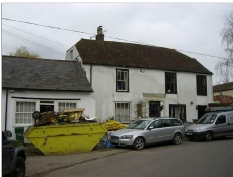
Smugglers End – recommended for Local Listing

'The house with a square porch was a great smuggling centre – it's difficult to find any old house in this part of the world that was not – and below the floor of the passage was found a hole or hide about four feet square. In the store above the shop is a small square piece of plain glass facing the Marsh and sea, behind which beacon lights were won't to flicker as signals to the smugglers below.'