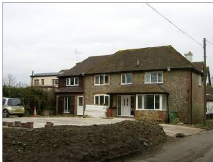
The cumulative effect of changes detract from the original character of the building and cause negative impact on the character of the CA