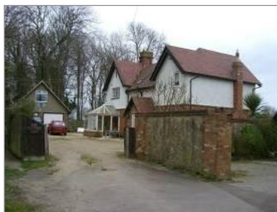
Left: Gradual deterioration is becoming prevalent within the CA through use of inappropriate materials Right: School House presents an enhancement opportunity