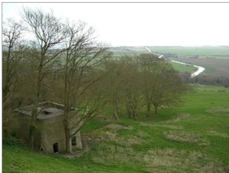
The Pump/Spout House