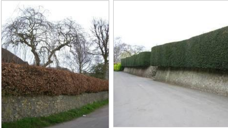
Castle Close – enhanced by well maintained boundary walls and hedging