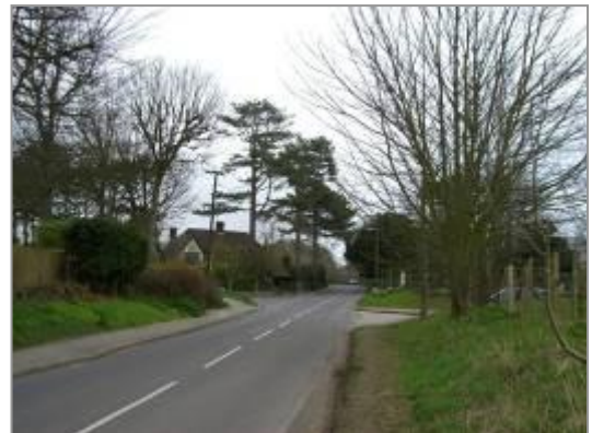
Clockwise from top left: View towards the Castle from the Aldington Road entrance; Castle Close and the Lych Gate; The Castle and St Stephen's Church from Stutfall Ruins; View east out of the CA along the Aldington Road.