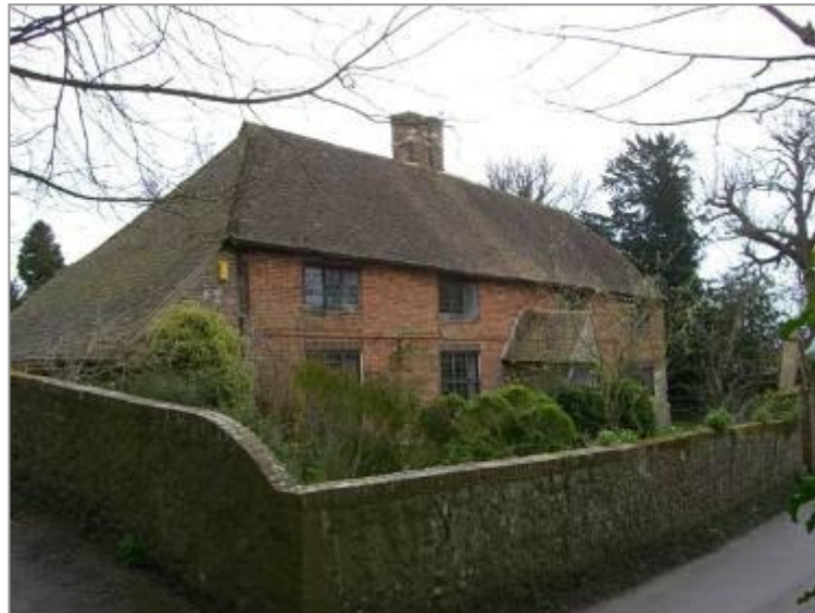
Lympne Hall still retains internal features dating back to the 1500's