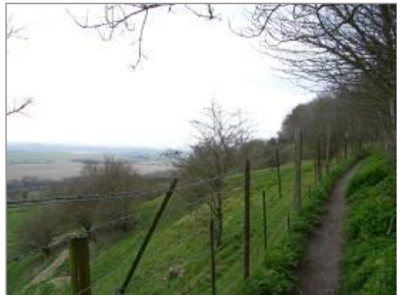
Left: The Street – certain areas would benefit from maintenance and clearing; Right: Potential for sensitively designed fencing along the Saxon Shore Way