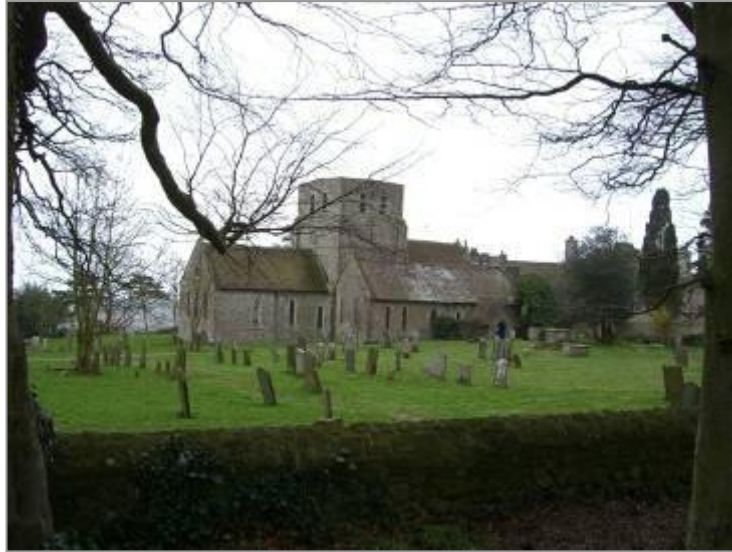
The Norman Church of St Stephen's – one of Lympe's oldest surviving structures

Incrementally added to over the centuries and restored in the C19 th it is constructed of uncoursed ragstone with Caen-stone, tufa and ragstone dressings with a plain tile roof. To the interior, a continuous crown-post roof covers the north aisle and chapel with moulded octagonal crown posts, chamfered tie beams and solid spandrel braces.