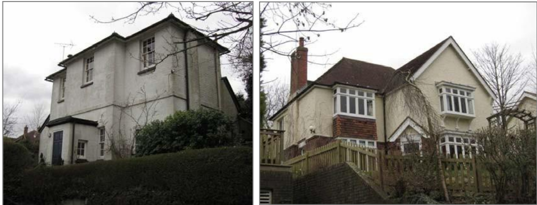
Left: the Old Lock-Up. Right: typical Edwardian villa overlooking the Old Road