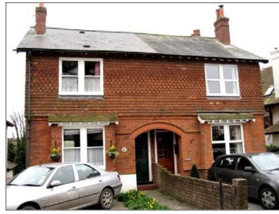
Tilework: as illusion (Wise Follies, left) and as decoration (Bank Side/St Zita)