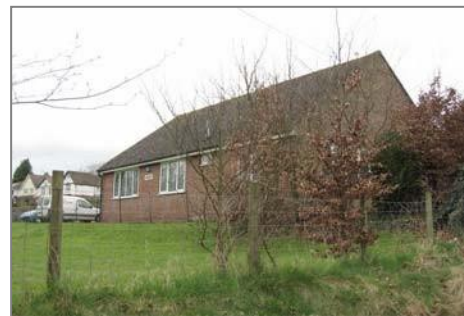
Left: Springfields. Right: the Surgery