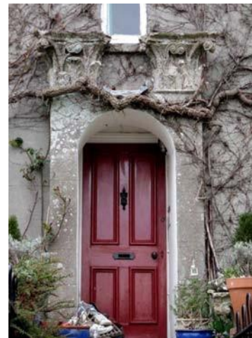
Above: Fairfield Cottage with detail of porch. Below: Elmcroft