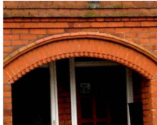
Brickwork patterns: chainâge (Coopers, left) and decorative moulding (Bank Side/St Zita, right)