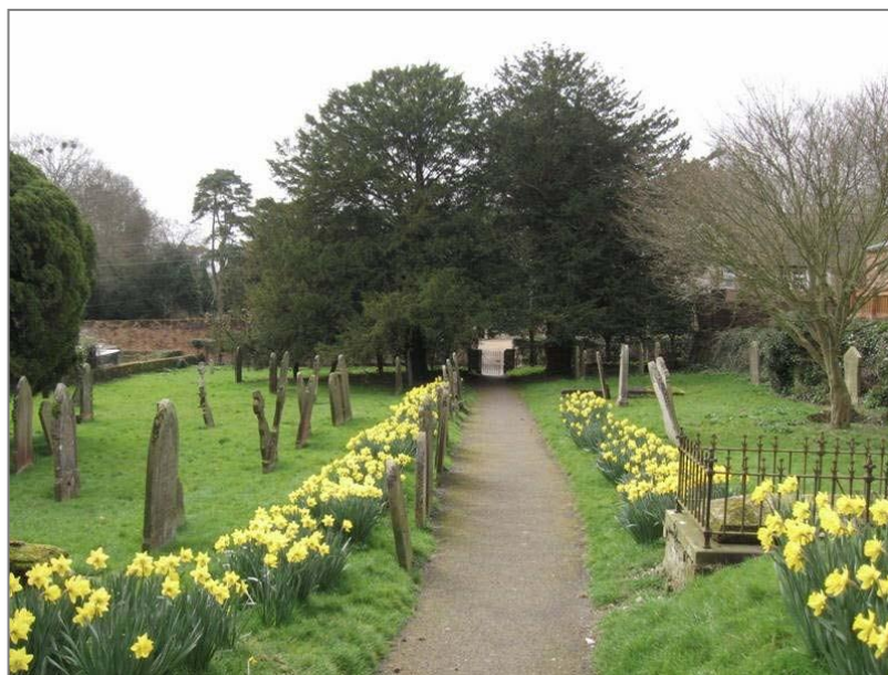
Yew trees in the churchyard