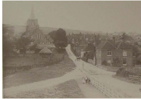
Left: The village from Duck Street. Right: contrast the 1912