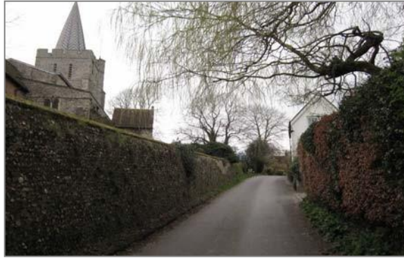
Duck Street showing Five Bells (right) and willow trees