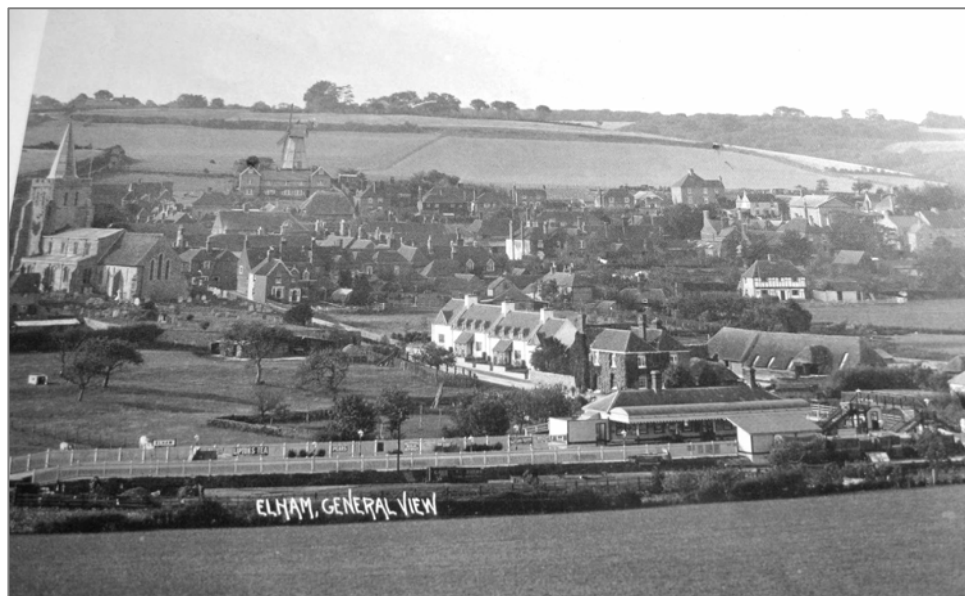
Early 20 th century postcard view with railway station in the foreground