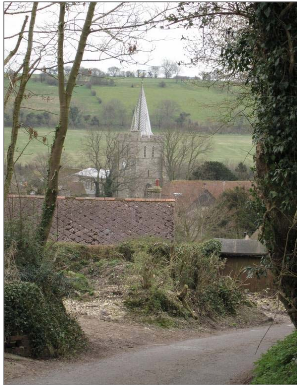
Elham from Cullens Hill