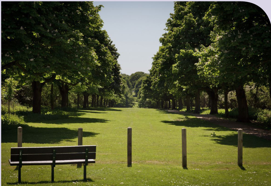
Letchworth Garden City © 2017

ii. Although the precise model for the Trust will need to be agreed, it must be a viable business model that ensures Otterpool Park has an empowered, self-reliant community that can manage its own key assets and have local people at the centre of place making and town life.