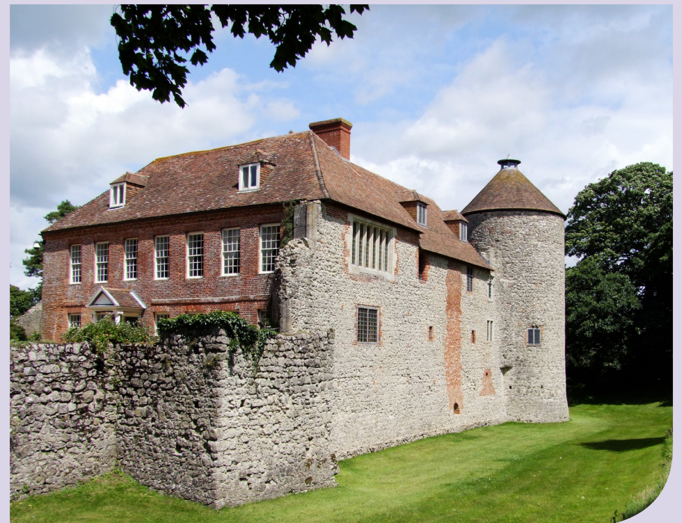
Westenhanger Castle