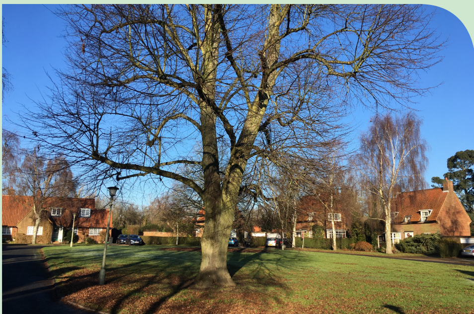
Welwyn Garden City © 2017