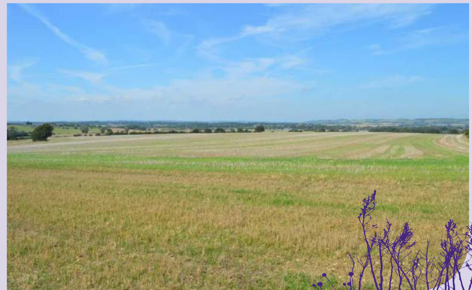
Land at Otterpool © 2017