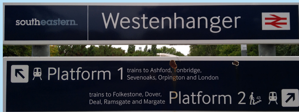
Westenhanger Station

viii. Where new and sustainable forms of infrastructure provision cannot be provided within the new settlement, existing infrastructure assets such as reservoirs, wastewater treatment works and energy installations shall be upgraded without causing environmental harm.