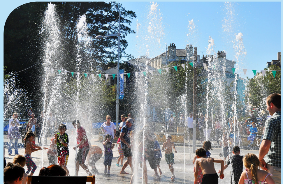
Fountains at Folkestone Harbour © 2017

viii. The town centre shall also include a mix of entertainment venues and sports activities that meet the needs of all age groups.