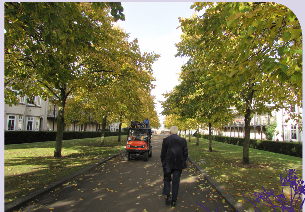
Ingress Park © 2017

vi. Building materials, landscaping and design shall be of a consistently high quality throughout the new settlement regardless of tenure type.