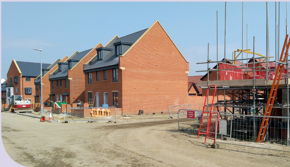
Shorncliffe Heights © 2017

iv. Housing shall be planned to provide integrated communities with build, design and landscaping quality consistent regardless of phasing, tenure or market sector.