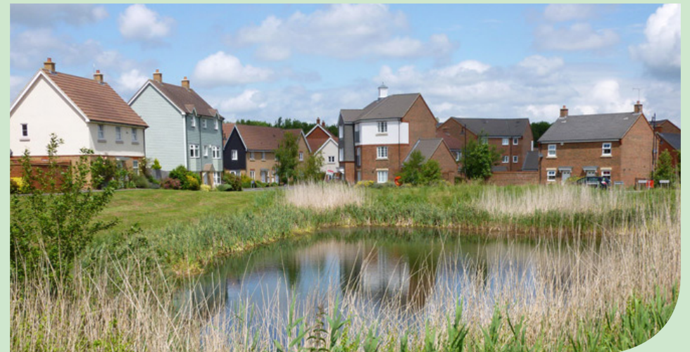
Kirk View, Singleton Hill, Ashford