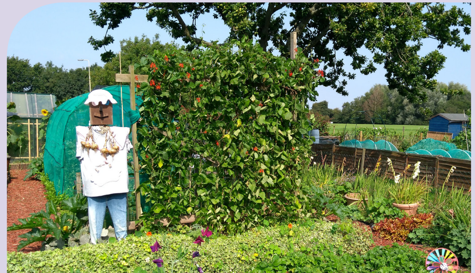
Hawkinge Allotments © 2017

xi. Water use for irrigating crops shall be minimised so far as possible and will incorporate rainwater harvesting or reuse, taking into account any public health issues.