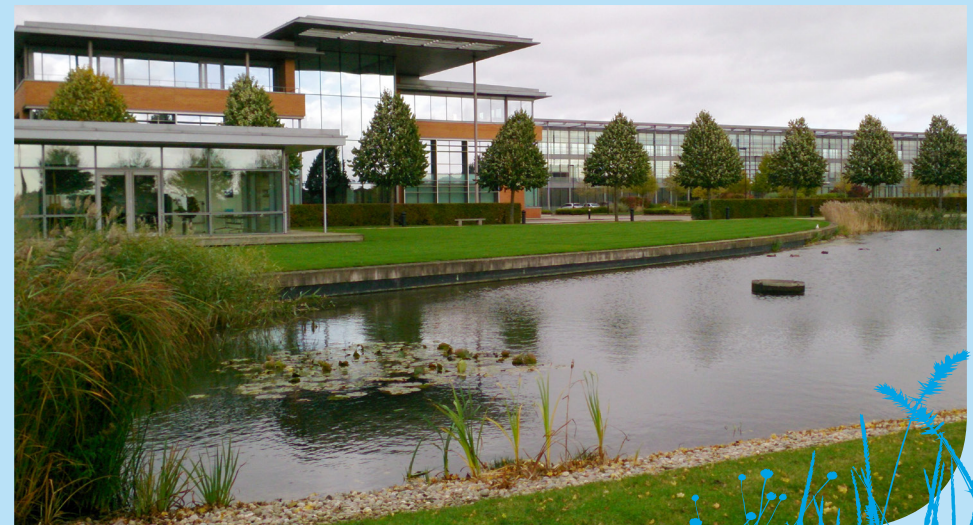
Cambourne Business Park © 2016

x. Businesses locating at Otterpool Park will be expected to be an active part of the community and help infuse a spirit of entrepreneurship and enterprise that will be a hallmark for a 'good economy' location.