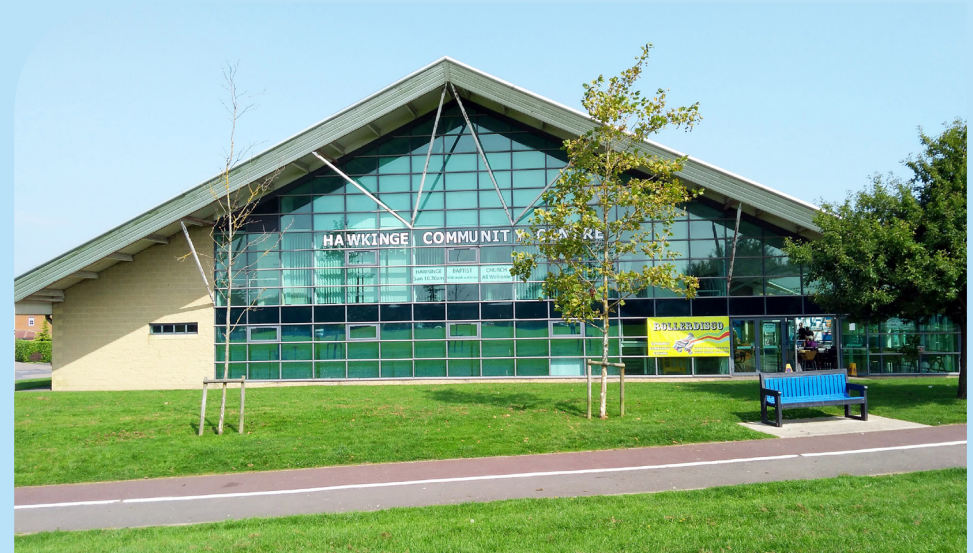
Hawkinge Community Centre © 2017

vii. Road infrastructure shall be designed for a low speed environment, with priority given to pedestrians and cyclists and the minimisation of grade separation, roundabouts and highway furniture.