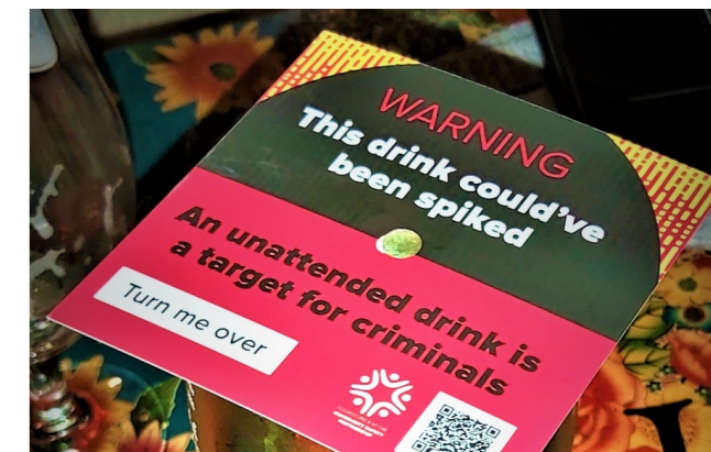
Spiking prevention beer mats distributed to licensed venues to raise awareness of spiking their customers.