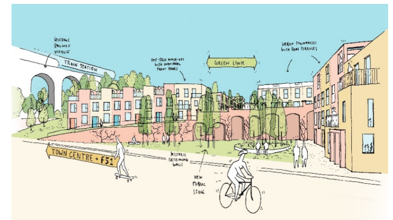
Artist Impression of the Ship Street site.