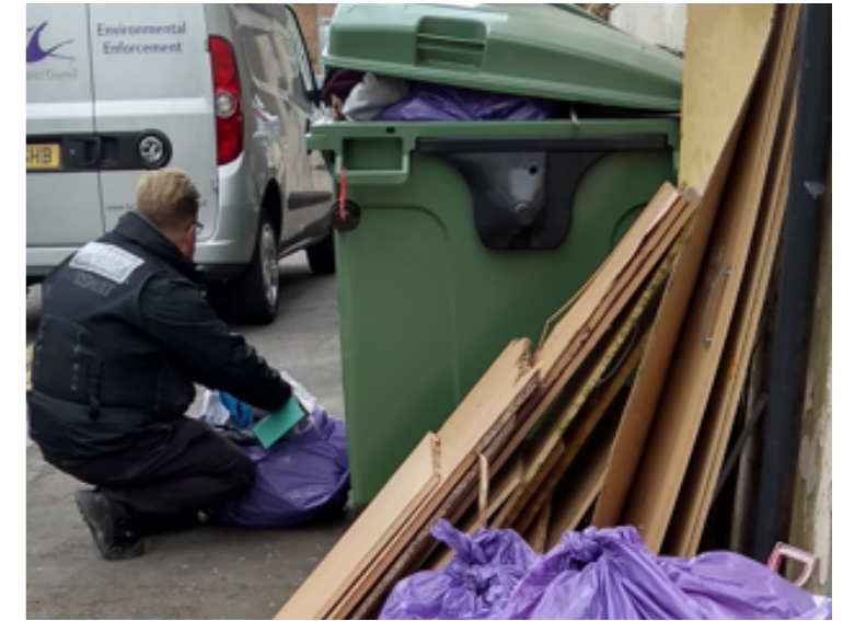
Officer waste search in Charlotte Street