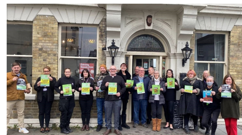
Meeting of the National Pub Watch Scheme in the district with officers from the council's Licensing team and Community Safety Unit