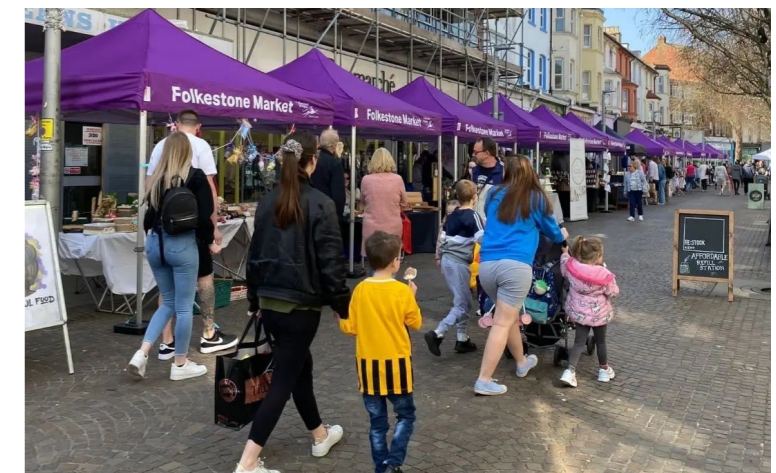
'A Kentish Spring Market' hosted in Folkestone that accessed funding support from the 'Welcome Back Fund'.