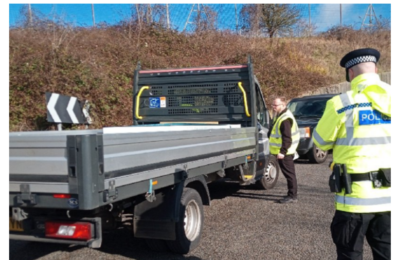
Environmental Enforcement Officers and Kent Police undertaking checks as part of Op Assist