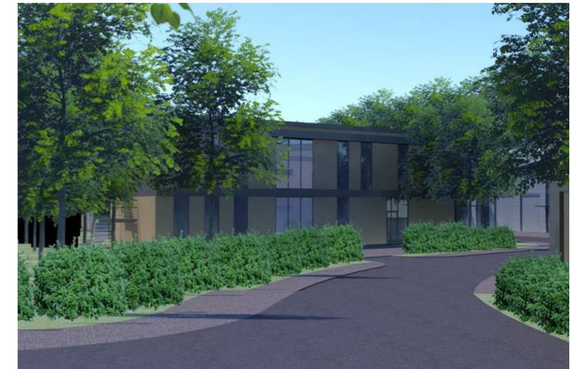
Artist Impression of the Bigginswood site in Folkestone