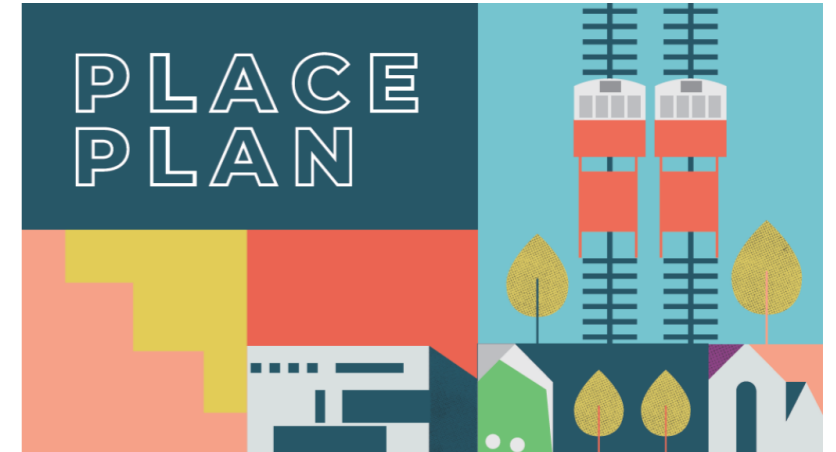
Folkestone Place Plan