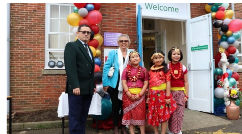
Opening of the new Nepalese Community Centre in Cheriton