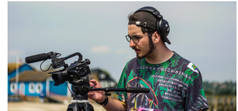
Funding from Folkestone Community Works is supporting the 'Open Doors' Project run by Screen South