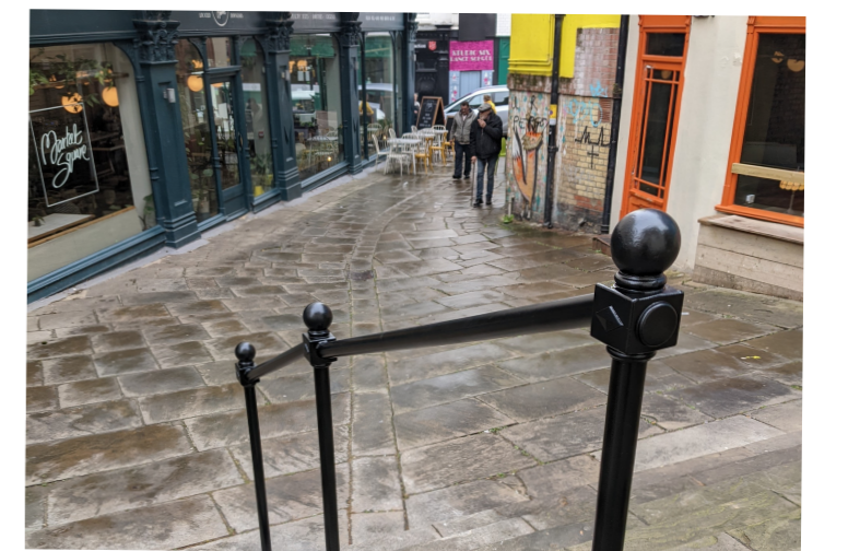
Repointing of the pavement and new handrails installed off Rendezvous Street, Folkestone as part of public realm improvements funded by the 'Welcome Back Fund' during the year.