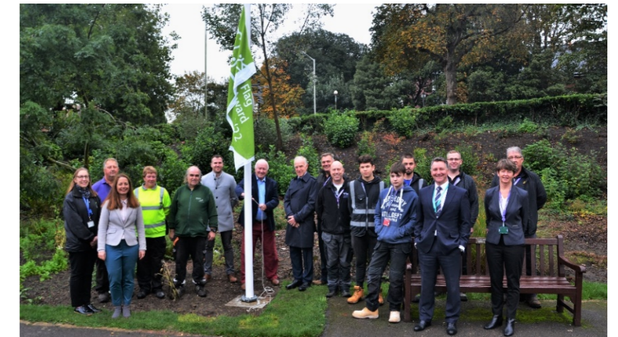
Raising the Green flag in Kingsnorth Gardens. The fourth green space in the district to receive the prestigious award.