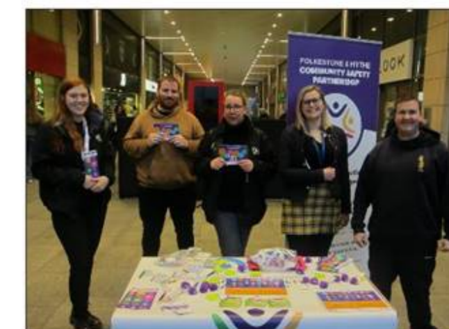
Multi Agency partners hosting a stand in Bouverie Place to raise awareness of violence against women.