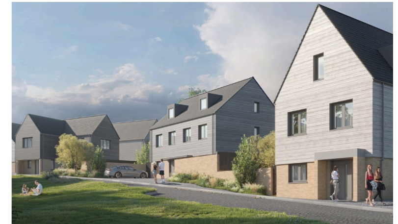
Artist Impression of new low energy homes at the former Highview school site.