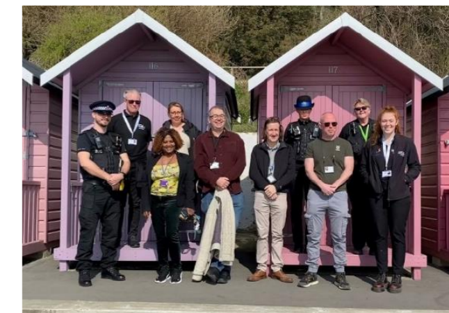
Multi Agency partners attending Operation Sunshine, a monthly meeting to address community safety issues.