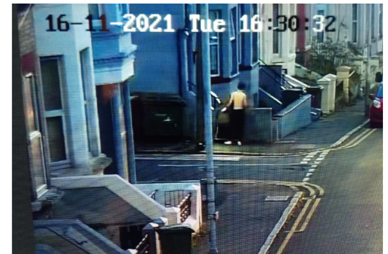
Caught in the Act: Footage of fly tipping taking place