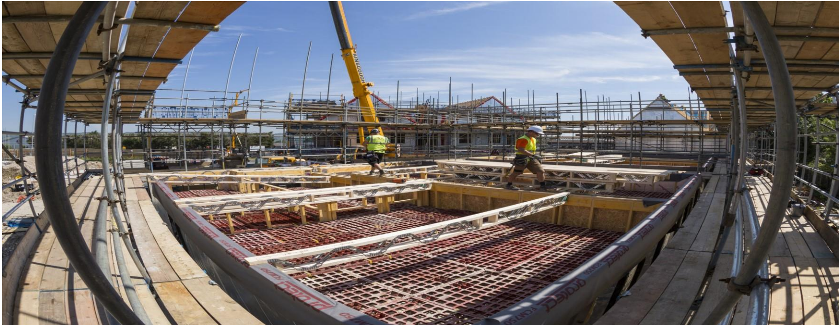
Military Road New Build: This will provide 28 homes for affordable rent and 7 homes for shared ownership purchase due for completion between February and June 2018.

through strategic sites within the Council's ownership across the district, which the Council is bringing forward for development over the next few years.