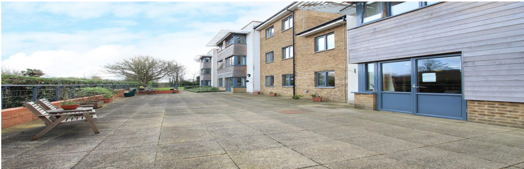
The first Extra-care supported housing scheme - Summer Court in Hythe