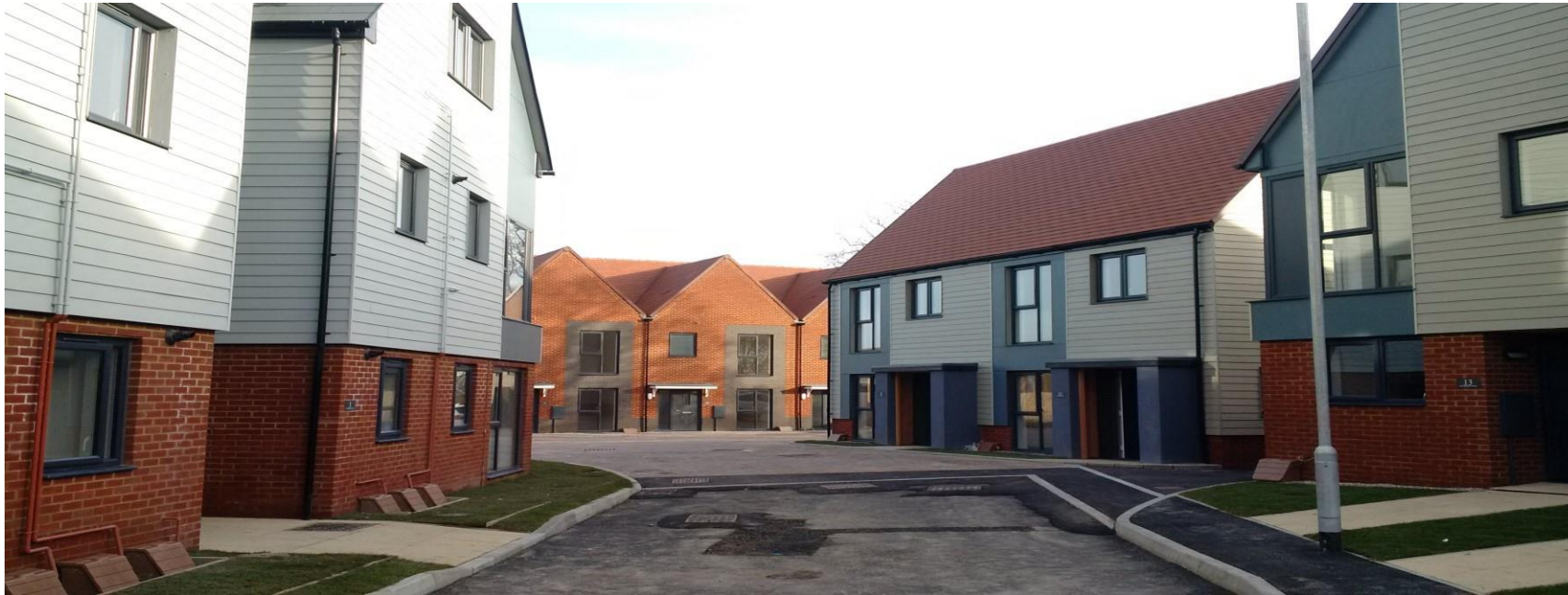
picture of new build houses