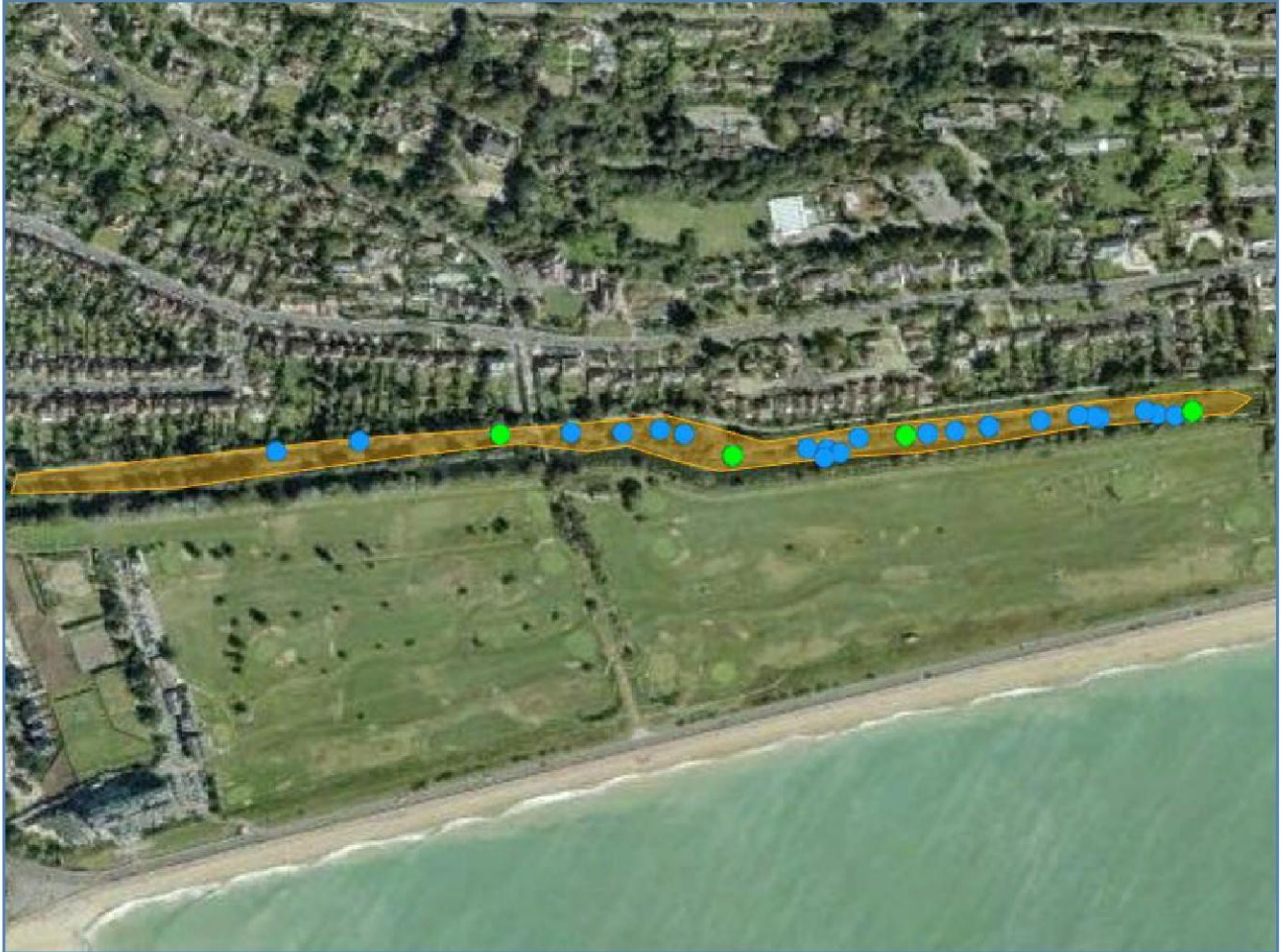
Figure 1 Reptile distribution plan. Plan shows locations where grass snakes were recorded on / under ACOs (green circles) in May 2018. Unoccupied ACOs are denoted by blue circles. Suitable reptile habitat is indicated in yellow.