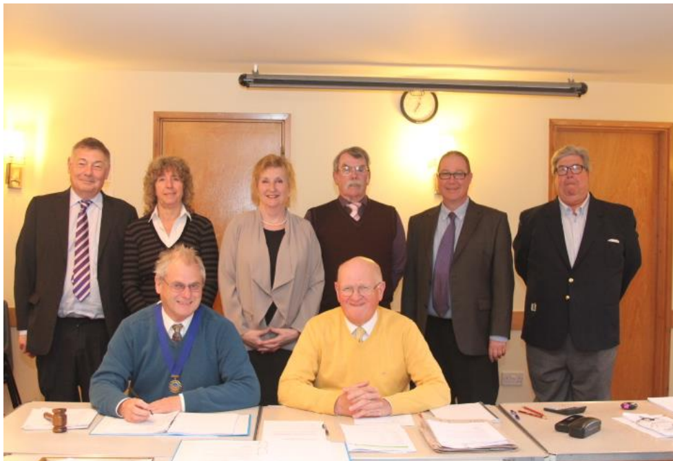
St. Mary in the Marsh Parish Council (2011-2015)

The St Mary in the Marsh Neighbourhood Plan is led by the St Mary in the Marsh Parish Council and aims to address local concerns and particularly to make provision for younger people by creating suitable housing, leisure and employment opportunities. It will improve the physical environment and encourage the development of new leisure and recreation facilities while supporting investment in farms and agriculture.