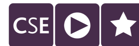
Successful reapplication of the council's Customer Service Excellence accreditation with 16 compliance pluses