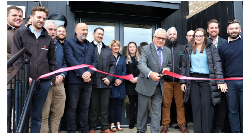
Opening of 27 new homes for local people in Cheriton