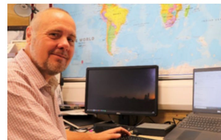
FCW funding awarded to Amor Europe will support them with costs for reporting on the impact of water filters in eradicating waterborne diseases in overseas countries.