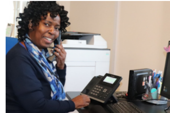
The Rainbow Centre benefited from a new phone system thanks to FCW funding.