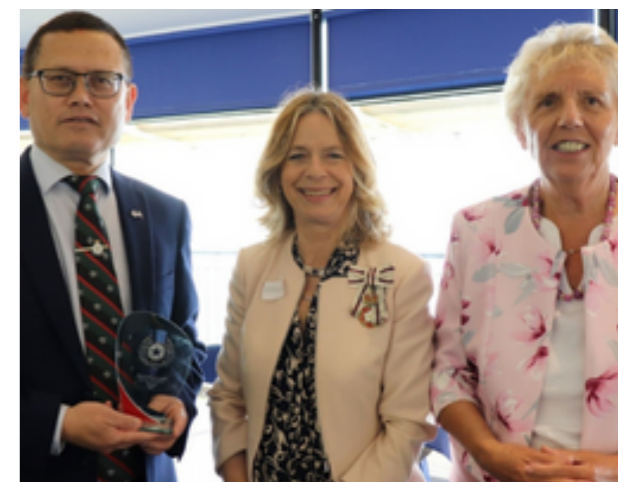
The district hosted the eight annual Kent & Medway Armed Forces Covenant Conference