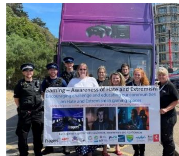
The Gaming Bus came to the district to raise awareness of hate and extremism with young people.