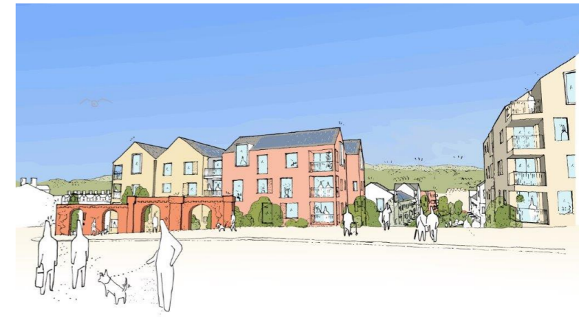
Artist impression of Ship Street in Folkestone