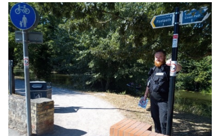
New signage being put up by Environmental Enforcement Officers on dog fouling