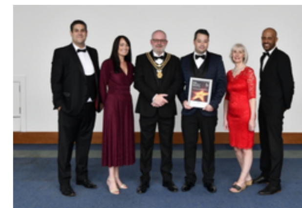
Revenue & Benefits team were awarded Benefits and/or Welfare Reform Team of the Year at the Institute of Revenues Rating and Valuation's Performance Awards (IRRV)