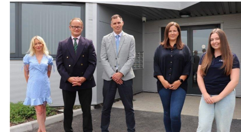
Tenants at the Romney Marsh Business Hub have benefitted from a grant scheme for new equipment and furnishings.