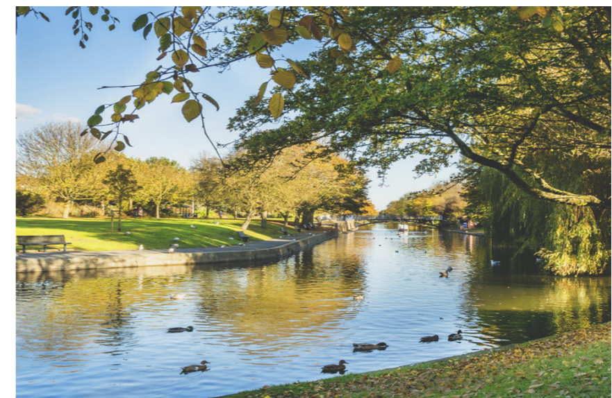
Royal Military Canal, Hythe