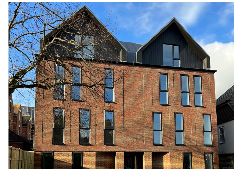
14 New homes delivered for affordable rent in Radnor Park Road, Folkestone