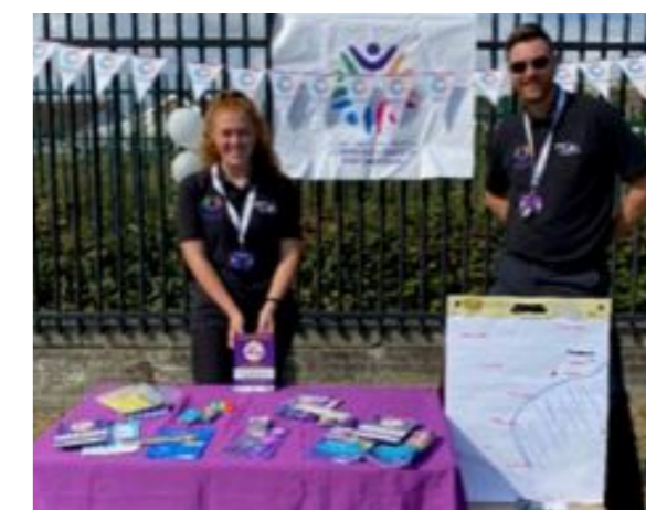
CSU officers at the Folkestone Youth Hub Festival