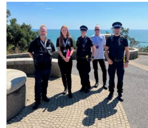
CSU and Enforcement teams out with Kent Police as part of Op Henosis