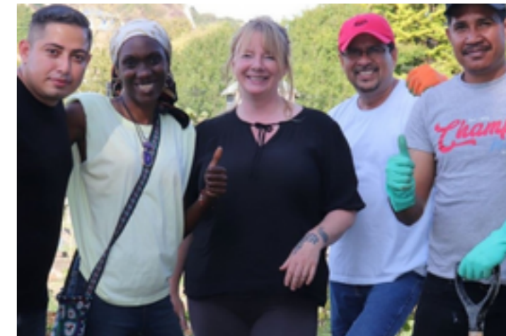
The Custom Food Lab benefited from new equipment and business development support thanks to FCW funding.