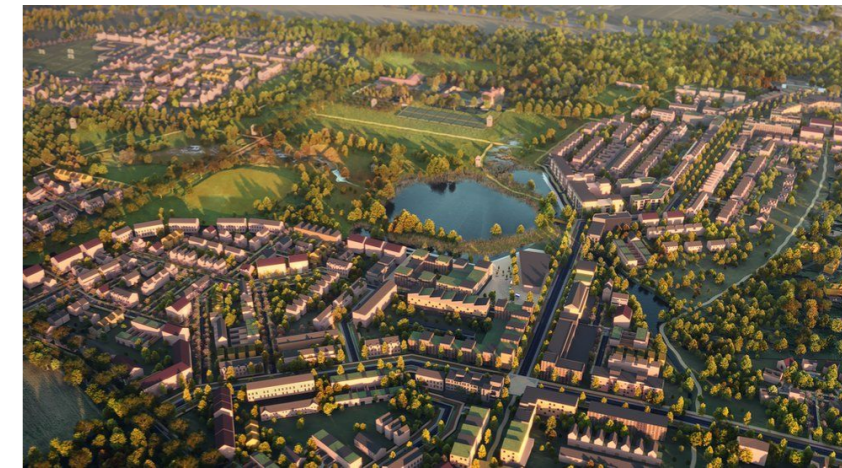
Artist impression of Otterpool Park, the district's new garden town