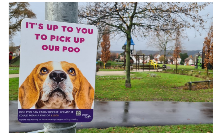
'It's up to you to pick up your poo' campaign signage to remind dog owners of their responsibility to pick waste after them.