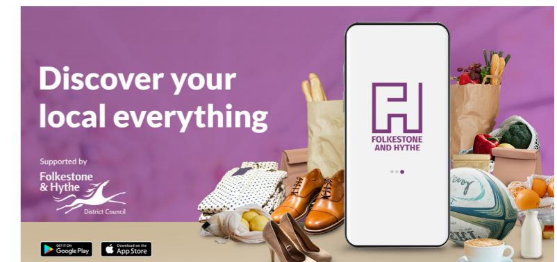
ExperienceFH app launched in partnership with Bulbtown gives instant access to a range of promotional offers, discounts, and events from businesses across the district.