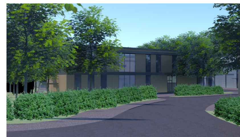
Artist impression of Biggins Wood in Folkestone