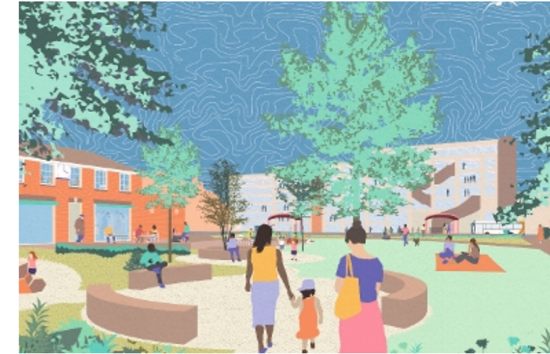
Artist impression of Bouverie Square, Folkestone to be delivered thanks to funding from the Levelling Up Fund.