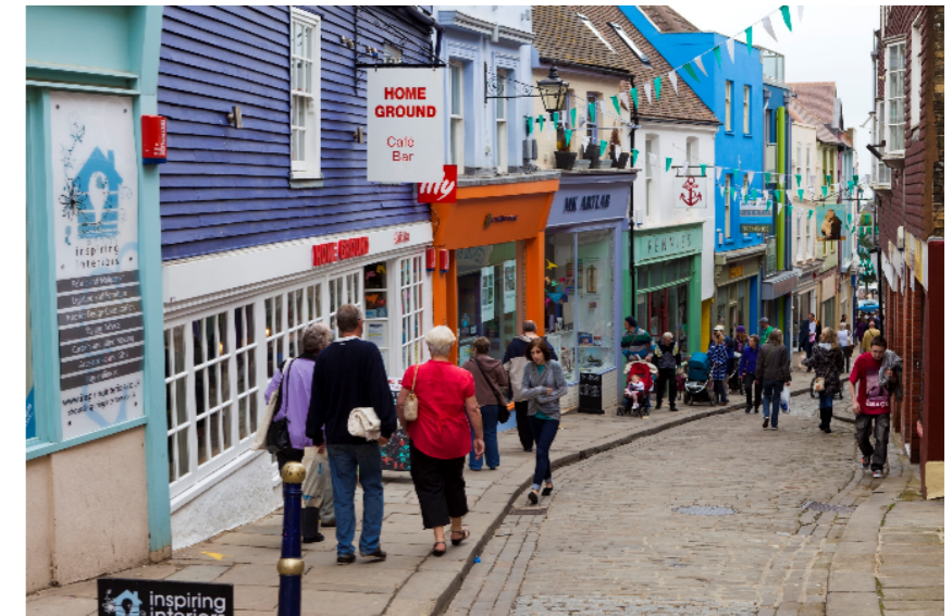
The Old High Street, Folkestone

We think our district is a great place to live, work and visit. It's where the past has made its mark and where a bright new future is unfolding. As the local authority for the district, we have a key role to play in shaping that future.