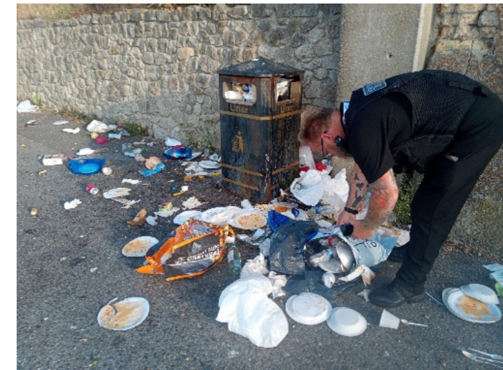
Environmental Enforcement on early morning patrol inspecting rubbish dumped irresponsibly