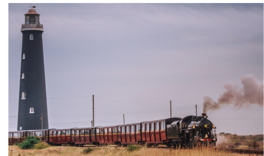
Dungeness, Romney Marsh