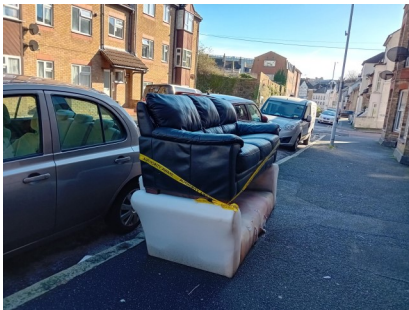
This fly-tipper received a £300 Fixed Penalty Notice for illegally dumping their sofas

Increased patrols in problematic areas resulted in officers issuing two Fixed Penalty Notices of £300 each for fly-tipping next to bins.