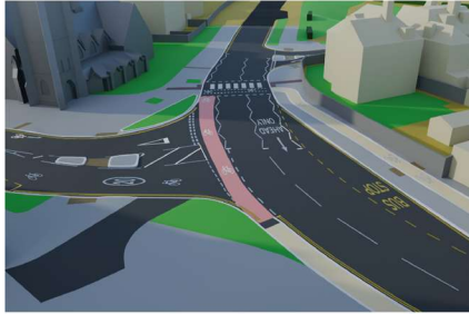
Top of Cheriton Road (Southbound)