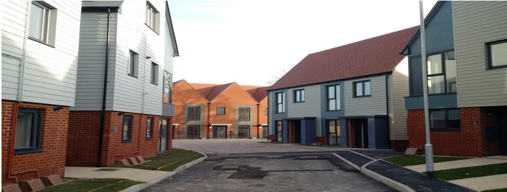
picture of new build houses