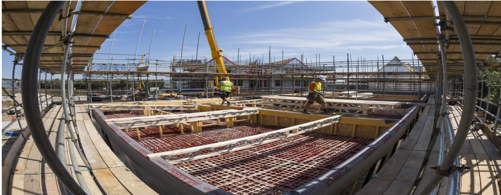
Military Road New Build: This will provide 28 homes for affordable rent and 7 homes for shared ownership purchase due for completion between February and June 2018.

through strategic sites within the Council's ownership across the district, which the Council is bringing forward for development over the next few years.